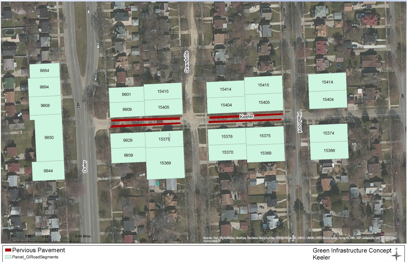
Location of pervious paver blocks along Keeler Street