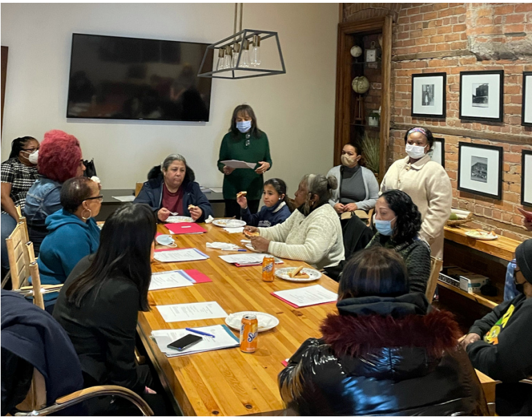
Attendees at February's Clement Kern Gardens Resident Council meeting at the TCB Community Life office.